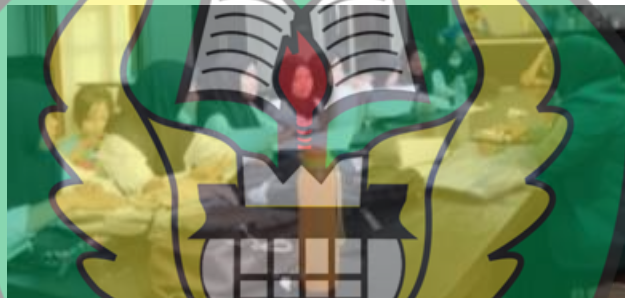
Pictuere 1.2 Arrangement Interview Students