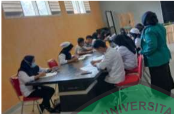
Pictuere 1.1 Arrangement text multiple coice