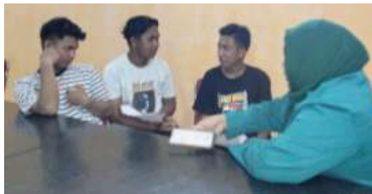
Pictuere 1.4 Arrangement interview Student