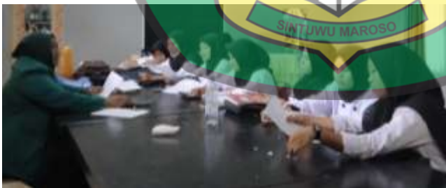
Pictuere 1.3 Arrangement interviuw Students